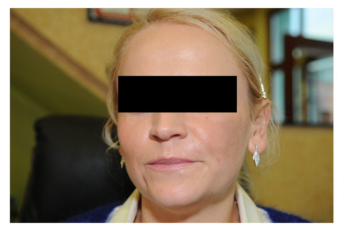
Figure 4 Patient's appearance after injection of 2 mL of hyaluronic acid into her left cheek.

from hours to days), the biofilm rapidly biodegrades along with hyaluronic acid.<sup>17</sup> Therefore, this complication should be considered solely with extended-duration hyaluronic acid material. To avoid such complications in the future, a study of the nature of biofilm specifically created on hyaluronic acid