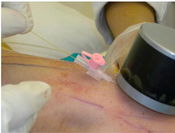
Figure 2 Introduction of a 21-gauge plastic venous catheter and subsequently of the fiber optic laser through an incision in the skin.

used at the skin access site and the arm surface is regularly cooled. 11 Obviously, multiple longitudinal channel drilling cannot be considered a radical management procedure for lymphedema. Because it achieves autonomous active lymphatic drainage, regular daily mechanical or manual pressotherapy 9 is required to keep the channels open and prevent further fibrotic reactions and obstruction of continuous lymph flow into the newly formed lumen. In our experience, it is mandatory to prepare a functional area in the normal dermis cephalad to the lymphedematous tissue in order to distribute the drained lymphatic volume recovered by daily pressotherapy through these short (15–20 cm) newly formed channels. Even if this step may damage the normal lymphatic network in the adjacent area, 12 it is necessary in order to facilitate uptake of fluid into normal lymphatic vessels. In