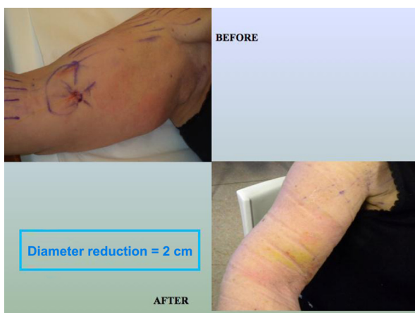
Figure 3 Two-cm reduction in right arm circumference after first treatment with Nd:YAG 1062 nm (15 W) endovenous laser.

used at the skin access site and the arm surface is regularly cooled. 11 Obviously, multiple longitudinal channel drilling cannot be considered a radical management procedure for lymphedema. Because it achieves autonomous active lymphatic drainage, regular daily mechanical or manual pressotherapy 9 is required to keep the channels open and prevent further fibrotic reactions and obstruction of continuous lymph flow into the newly formed lumen. In our experience, it is mandatory to prepare a functional area in the normal dermis cephalad to the lymphedematous tissue in order to distribute the drained lymphatic volume recovered by daily pressotherapy through these short (15–20 cm) newly formed channels. Even if this step may damage the normal lymphatic network in the adjacent area, 12 it is necessary in order to facilitate uptake of fluid into normal lymphatic vessels. In