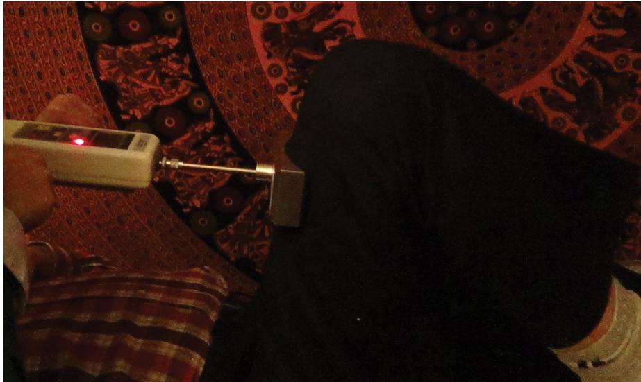
Figure 2: Right ankle dorsiflexion.