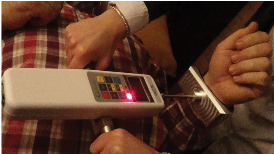
Figure 1: Left elbow extension.